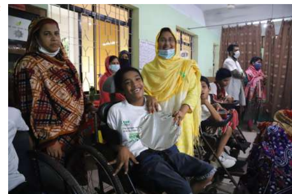
Prize giving on CP Day