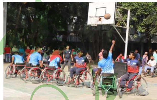
Wheelchair basketball friendly match

Bangladeshi branch of world’s largest sports and retail group Decathlon and Fakhruddin Textile Mills Limited donated 1000 T-shirts and face masks respectively. In the afternoon popular singer Asif Akbar visited CRP and sang for the patients.