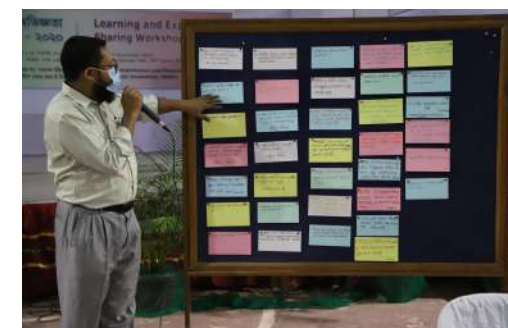
RRED Project Coordinator presenting group works