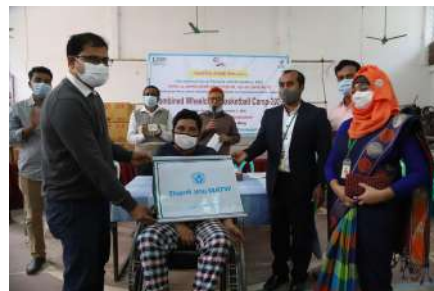
Social Welfare Officer of Savar Upazila handing over a wheelchair by MATW fund

Muslims Around the World, Australia has donated ten thousand Australian dollar to CRP for supporting the under privileged persons with disabilities. A total of 96 beneficiaries received wheelchairs and other assistive devices through the Social Welfare Department of CRP.