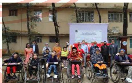
Assistive Device handover programme by PVH