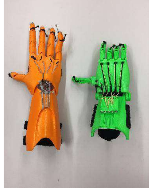
Artificial hands for children made by 3D printer